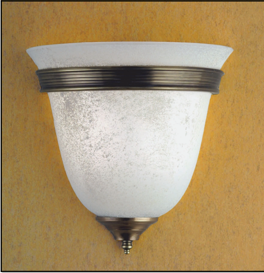
MODEL NO: 3166