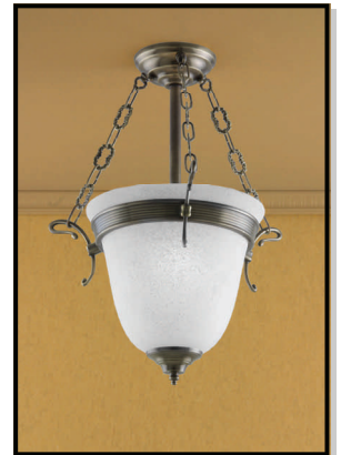
Pendant Item 2166