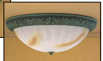
Ceiling Fixture Item 2531 / 2532 / 2533