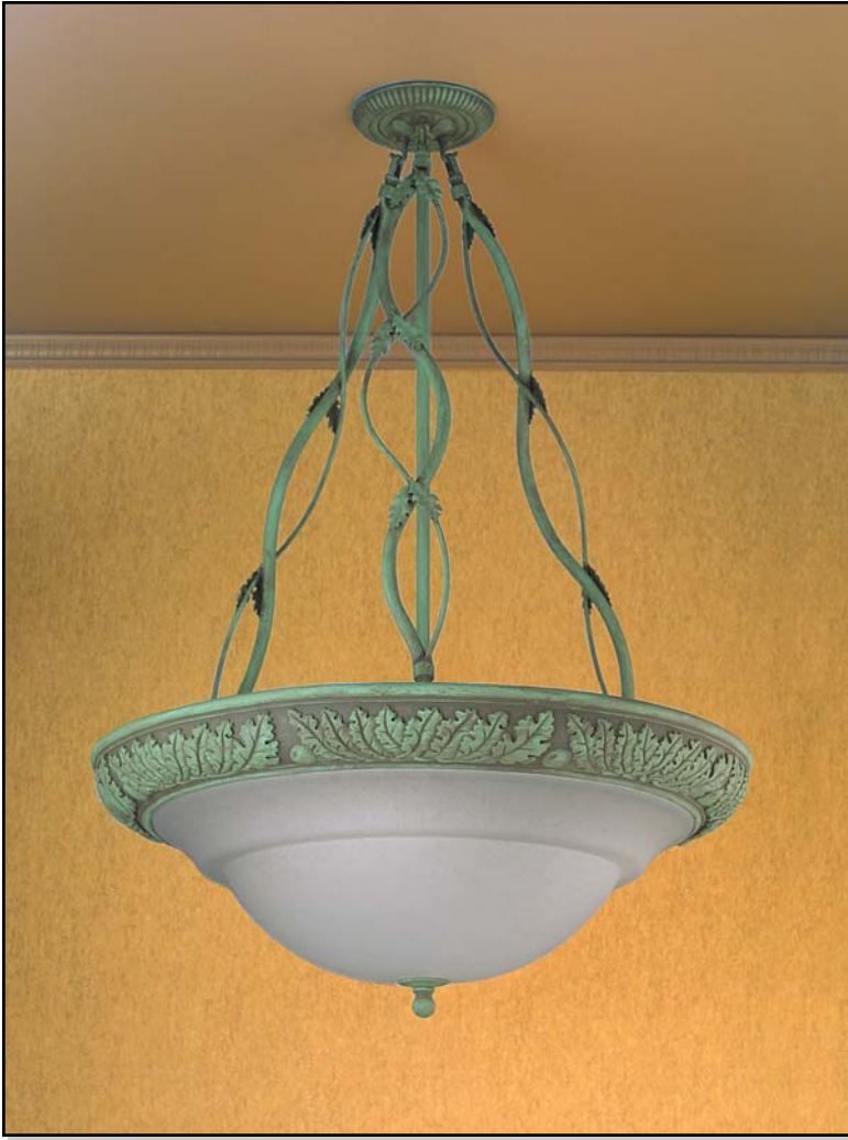
MODEL NO: 2631 / 2632 / 2633