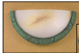
Sconce Item 3894 / 3895