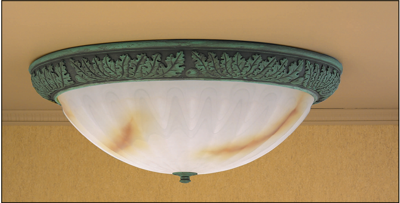
MODEL NO: 2531 / 2532 / 2533