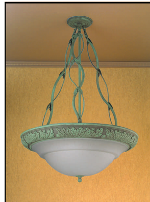
Pendant Item 2631 / 2632 / 2633