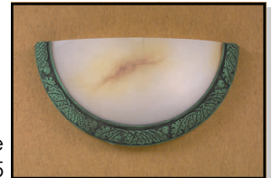
Sconce Item 3894 / 3895