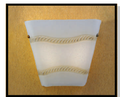
Sconce Item 3806