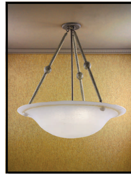
Pendant Item 2106