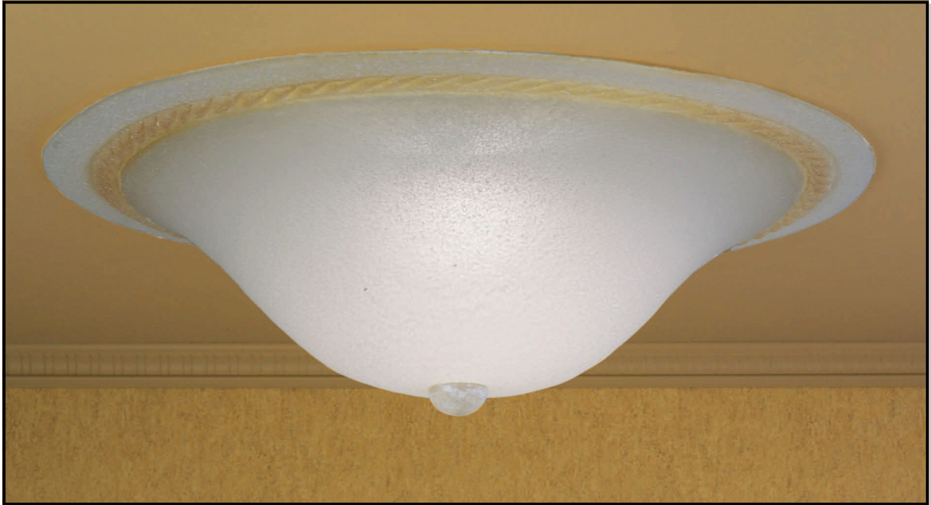
MODEL NO: 2206