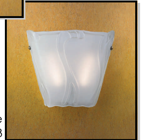
Sconce Item 3803