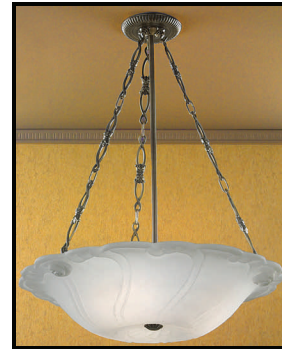
Pendant Item 2103