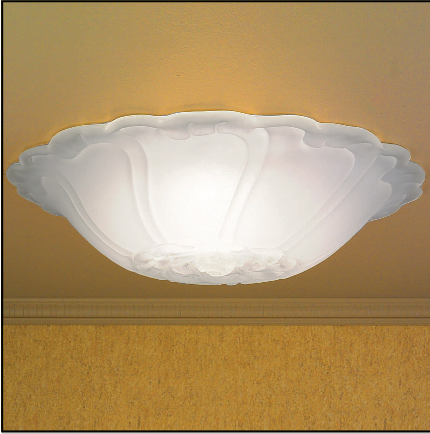
MODEL NO: 2203